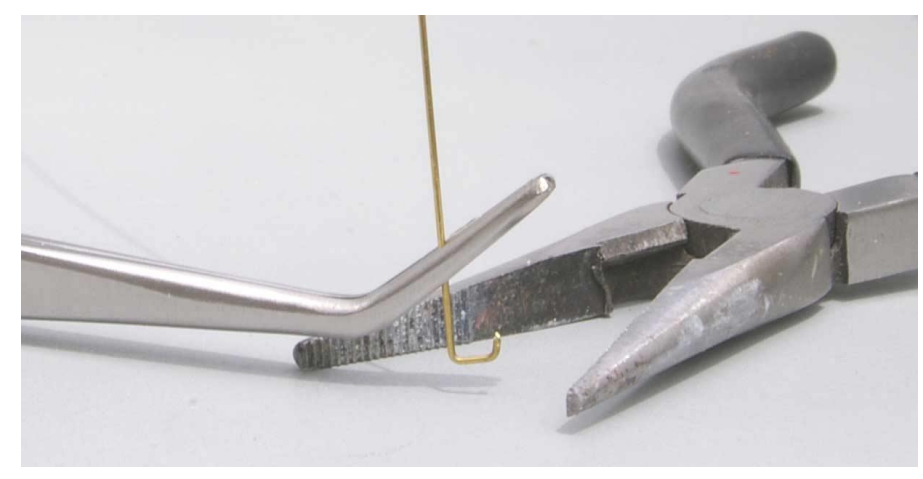
Brass rod bent to form a trailer hitch