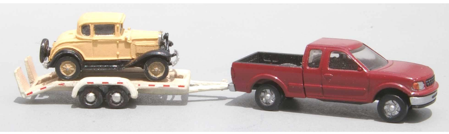
Atlas F-150 with Dmented tandem axle trailer and GHQ Ford Model A