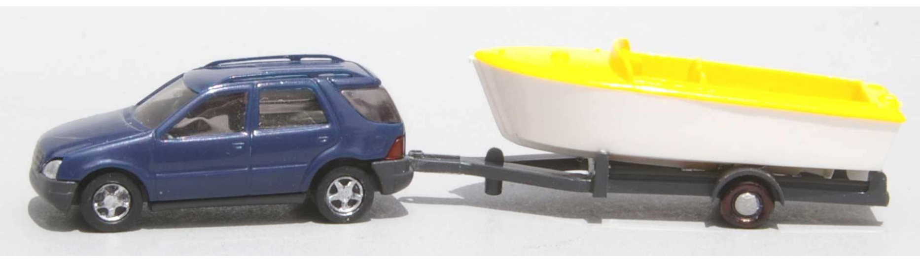
Busch Mercedes-Benz M Class with Wiking boat trailer